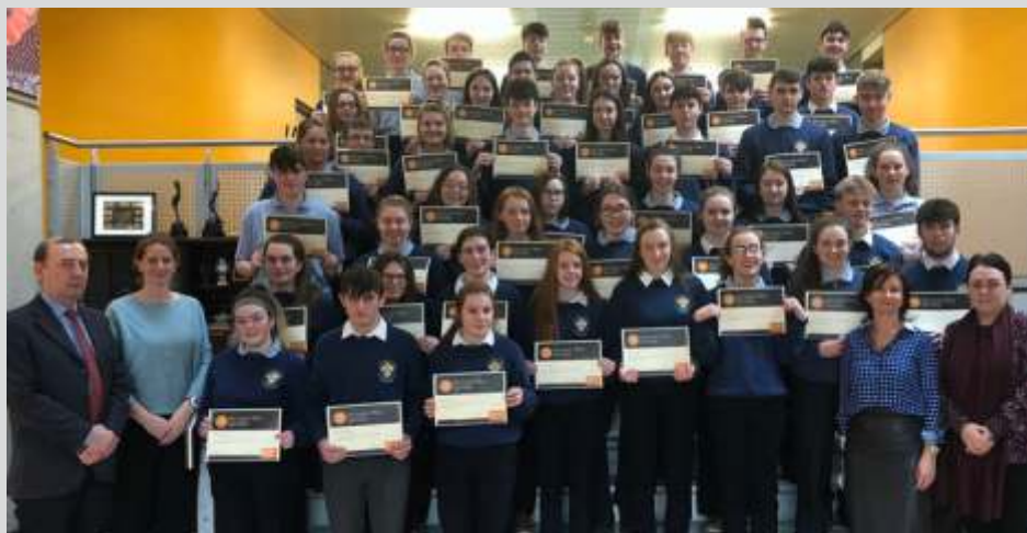
Presentation of Microsoft Office Specialist Certificates to BCCNS TY Students

Microsoft Office Specialist (MOS) certification is the leading IT certification in the world. More than 1 million MOS exams are taken every year in over 140 countries. Banagher College has now been delivering this course for four years.