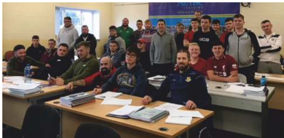
Phase 2 off-the-job electrical apprentices based in Mountrath, Co. Laois

There are over 200 approved employers in the Laois and Offaly region currently engaging with approximately 400 apprentices across a variety of trades. These trades include the craft apprenticeships in construction, engineering, electrical and motor. However apprentices in the region are also registered to new apprenticeships including Industrial Electrical Engineering (Level 7), Insurance Practice (Level 8) and Accounting Technician (Level 6). A phase 2 off-the-job six month electrical apprenticeship training placement for 28 apprentices is currently taking place in Mountrath where apprentices are trained under the guidance of qualified electrical instructors. For further information on apprenticeships visit www.apprenticeship.ie